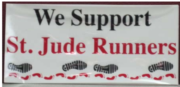
Static Cling Decal "St. Jude Runner" logo. 3" X 11" Clear.